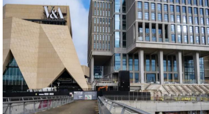
London College of Fashion