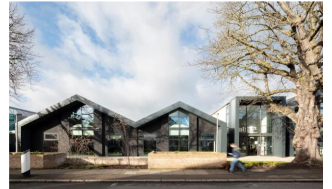
Wimbeldon College of Arts