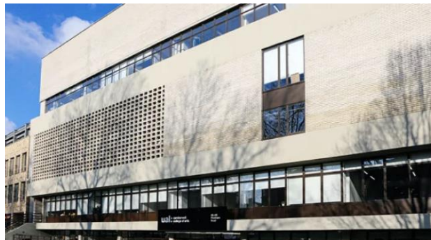
Camberwell College of Arts