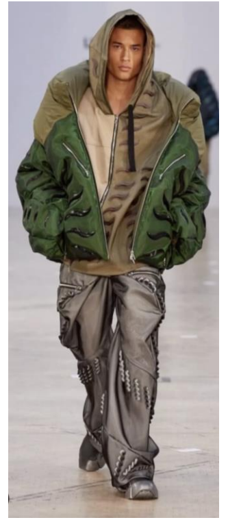
Fashion Folio class of 2024