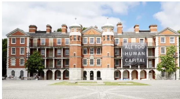
Chelsea College of Arts