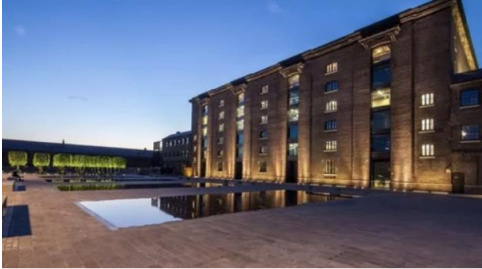
Central Saint Martins